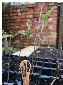
1/8 J Morwood