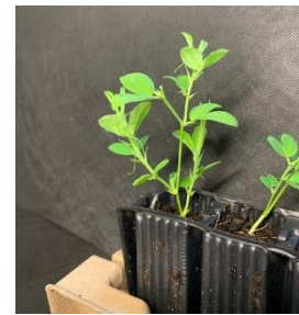
1/9 N Edwards JOINT WINNER