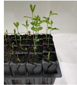
1/3 D Cairns