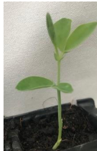
1/5 C Tate