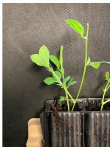
1/10 N Edwards