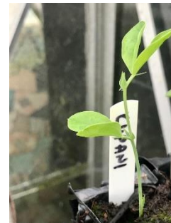
1/6 C Tate