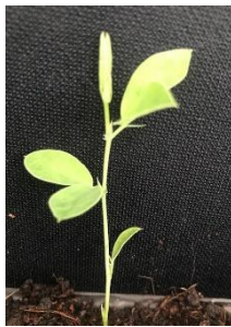
1/7 C Tate